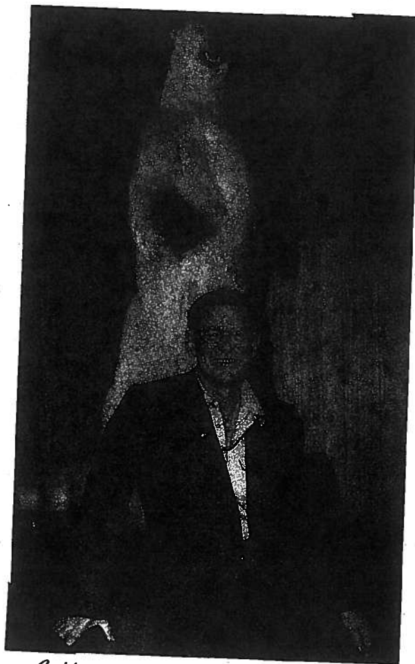
Coddling says investors bought stock in his bank because they had confidence in him.

With nearly 500 business accounts developed, Coddling Bank was sold to National Bank of the Redwoods in 1994, yielding nearly 800 stockholders a modest capital gain of about $2 a share—